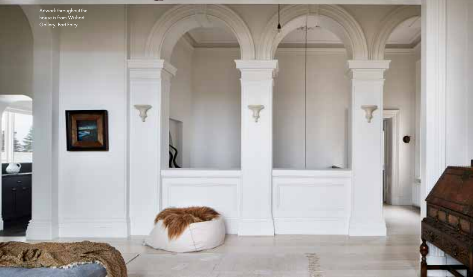
Artwork throughout the house is from Wishart Gallery, Port Fairy