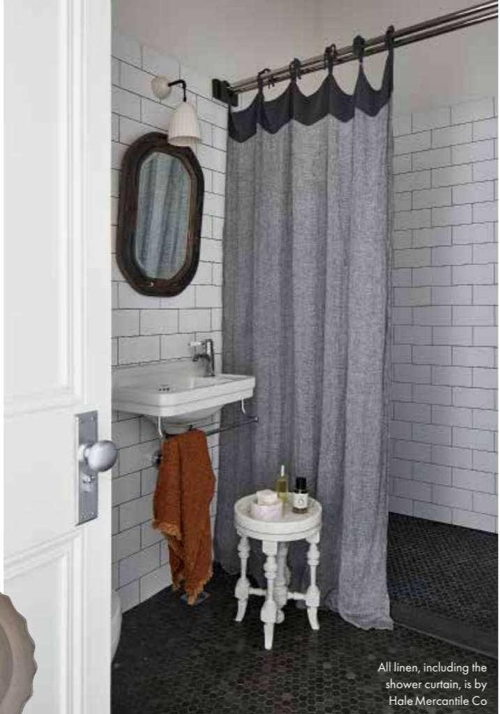
All linen, including the shower curtain, is by Hale Mercantile Co